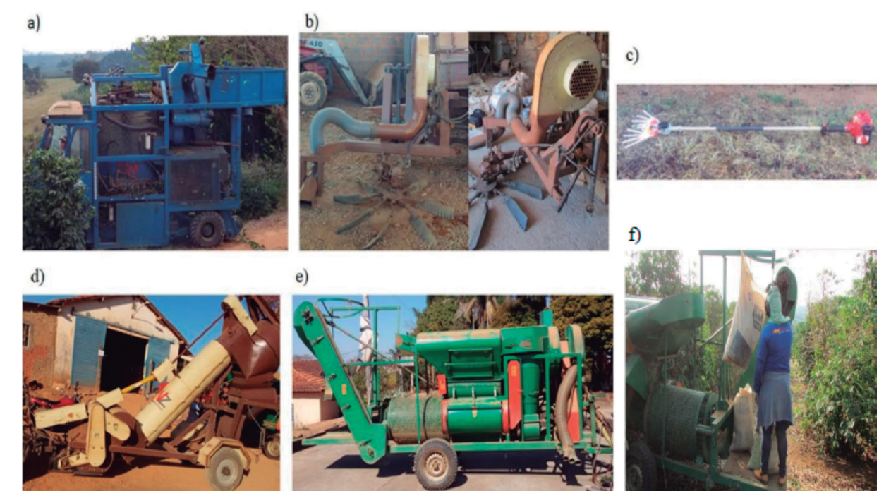
FIGURE 1 - Equipment used in mechanized and semi-mechanized harvesting coffee fruits: a) automotive harvester Electron Auto TDI, b) homemade blower, c) portable mechanical stripper, d) SWZ picker, e) Vicon picker and f) auxiliary worker position in the Vicon picker.

Throughout the data collection process, a wind shield was used in the dosimeter microphone to avoid possible air velocity interference and to protect the microphone against dust, as recommended by Giampaoli et al. (2001).